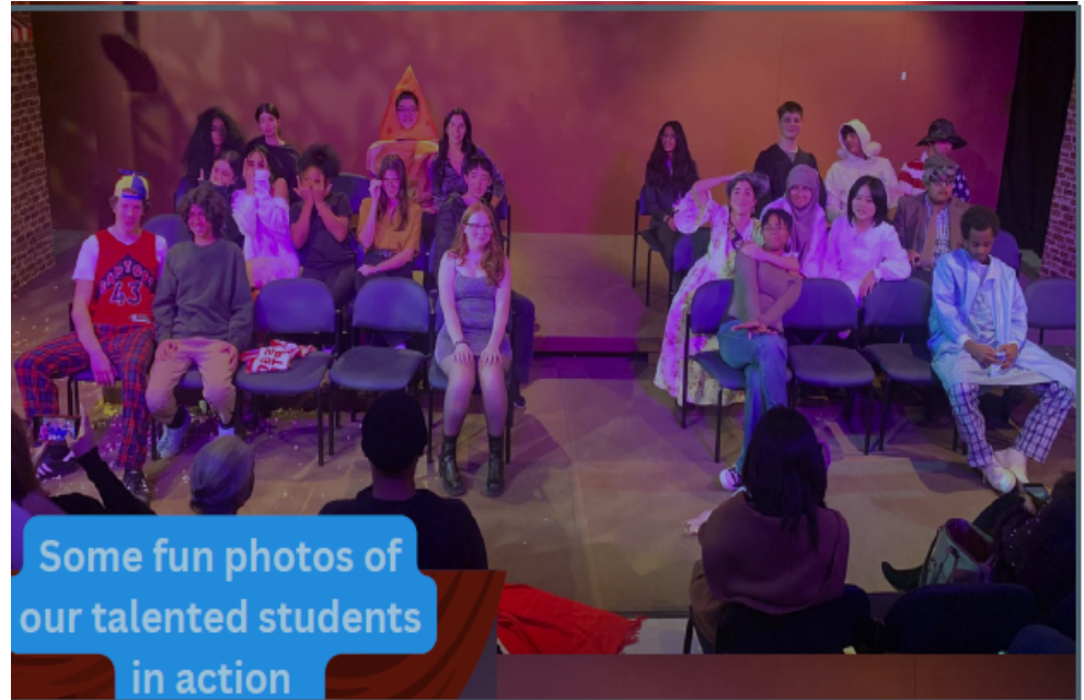
Some fun photos of our talented students in action